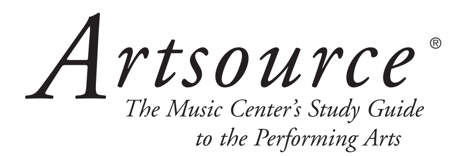
Table of Contents Theatre